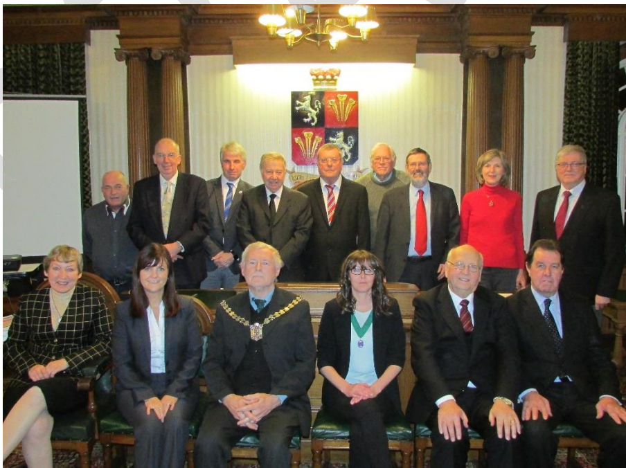
Mold Town Council 2017/18

This report includes examples of many of the Council's services which are delivered to all age groups in a variety of forms. The report describes Mold Town Council services which contribute to the well-being of Mold and its community.